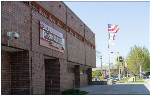
CSSI is assisting the Johnson County Board of Supervisors in assessing public opinion about the Sheriff's Office and Jail building.

CSSI and Tippie's Social Impact Community hosted an event for researchers and community professionals to discuss how to transform social science research into social change.